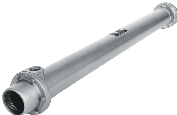
OPTION Mounting brackets